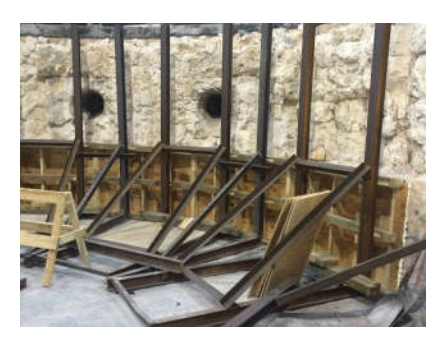
Lower Wall Form